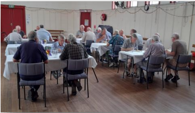
Photo: Men's Lunch October 2021.